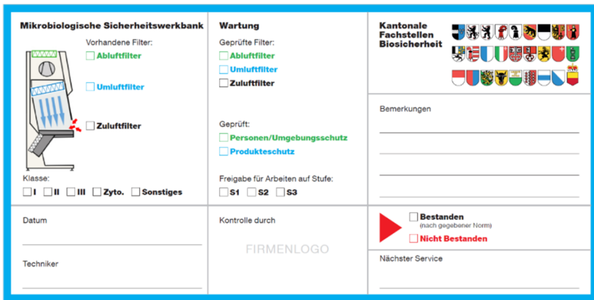
Maintenance sticker as recommended by the Cantonal Biosafety Specialist Offices.

Should you conclude a new service contract for your BSC, please note that the corresponding checks are included in the maintenance scope. Even with existing contracts, it's worth looking at the details and making adjustments if necessary to ensure that your BSCs are safe for use in your BSL2 labs.