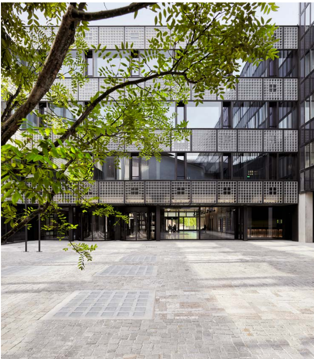
View of the Inner Courtyard