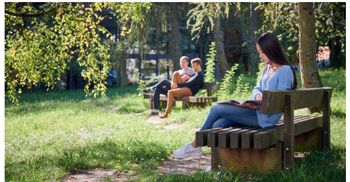
Green space on Hönggerberg campus for studying and socialising

Over twenty Nobel laureates have studied, taught or conducted research at ETH, underlining the university's excellent reputation. Also, ETH regularly features in international rankings as one of the best universities in the world. Students can choose between 24 Bachelor's degree programmes and over 40 Master's degree programmes.