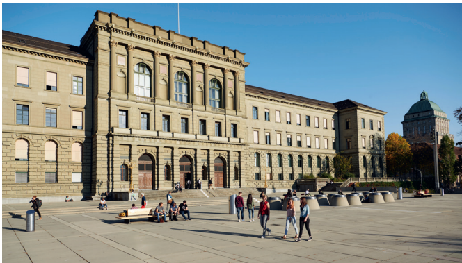
The main building, designed by Gottfried Semper, opened in 1864.